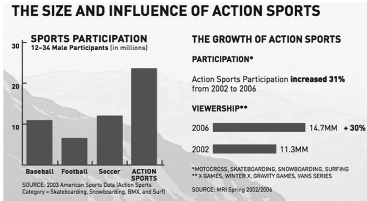
Figure 5.1 Size and influence of action sports in the United States